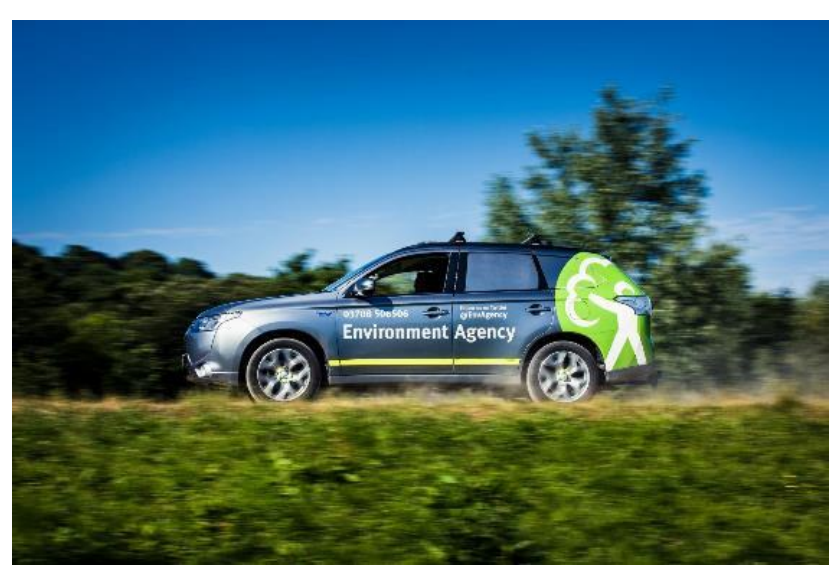
Website | Twitter | Facebook | LinkedIn | Instagram | Flickr | YouTube http://www.gov.uk/environment-agency