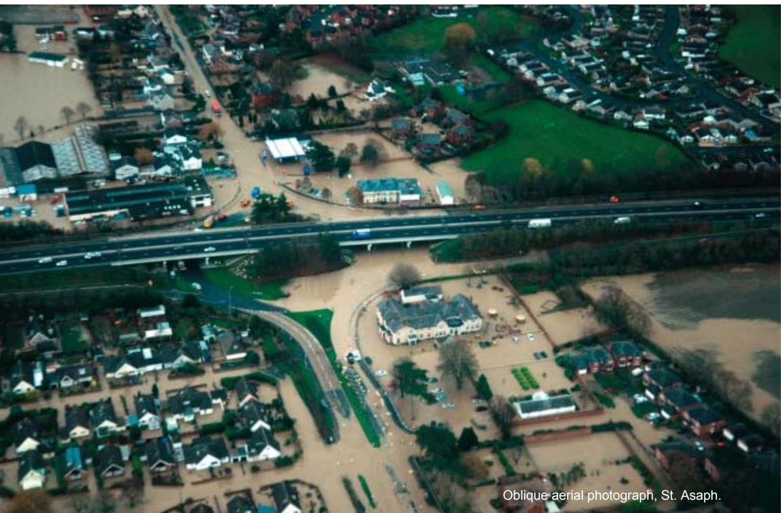
Oblique aerial photograph, St. Asaph.