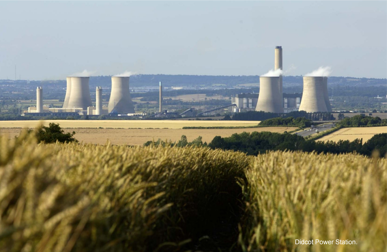
Didcot Power Station.