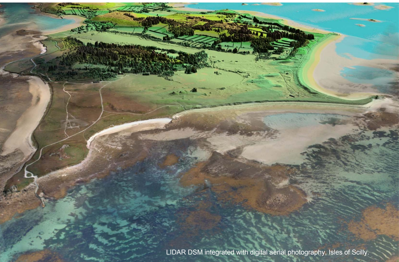
LIDAR DSM integrated with digital aerial photography, Isles of Scilly.

Data download: https://environment.data.gov.uk/DefraDataDownload/?Mode=survey