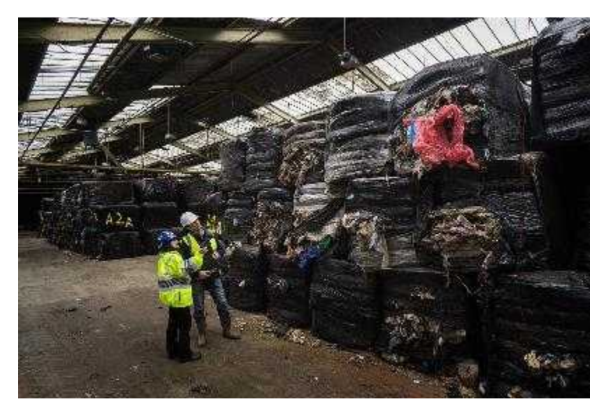
Website | Twitter | Facebook | LinkedIn | Instagram | Flickr | YouTube