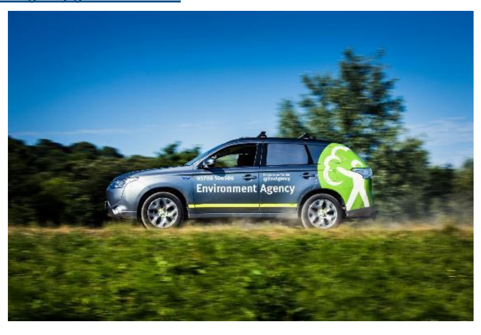
Website | Twitter | Facebook | LinkedIn | Instagram | Flickr | YouTube