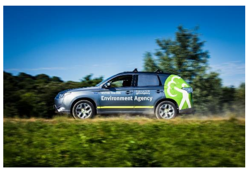
Website | Twitter | Facebook | LinkedIn | Instagram | Flickr | YouTube http://www.gov.uk/environment-agency